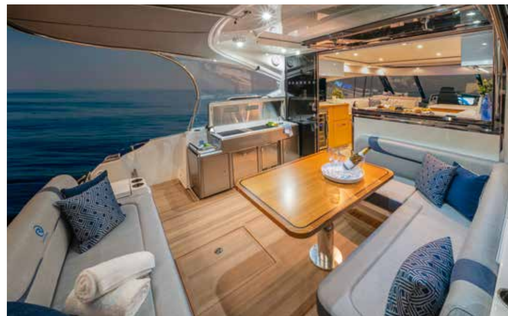
Right: Like all its siblings, there is a seamless flow on the 4800 between the saloon and superbly appointed cockpit.