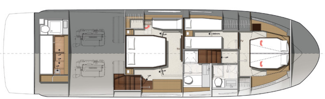
*Model available with tender garage or skipper cabin