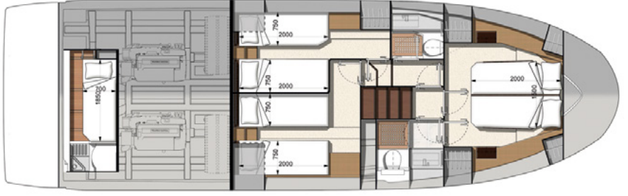
Model available with 3 cabins