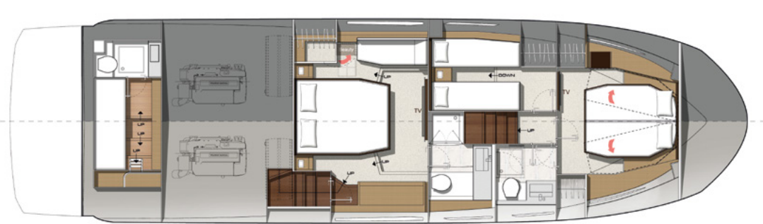
*Model available with tender garage or skipper cabin